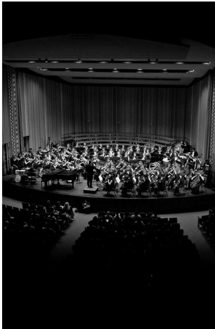
Philadelphia Sinfonia in Irvine Auditorium.