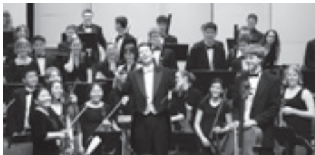
From the best of Sinfonia's photo-archive: 2009; curtain call in Buenos Aires.