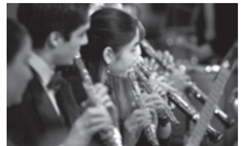
From the best of Sinfonia's photo-archive: 2006.