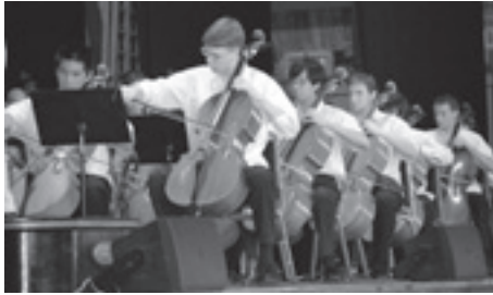
From the best of Sinfonia's photo-archive: 2010; in concert at The Mann Center for the Performing Arts.

The new look you see reflects the mature orchestra we have become: record auditions and membership, strikingly rich and efficient rehearsals, a second side-by-side partnership with The Philadelphia Orchestra, extensive sectional work, masterful performances of orchestral benchmarks such as Mahler's Symphony No. 1 , collaborations and educational partnerships with organizations like Network for New Music, The Mann Center for the Performing Arts, and the newest good idea in music – Play On, Philly!, a national youth orchestra award, global travels with packed concert halls, and civic engagement here and abroad.