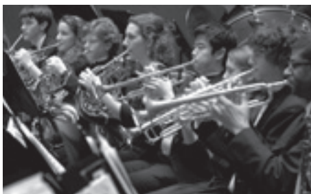
From the best of Sinfonia's photo-archive: 2008.